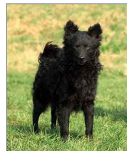
In general, the Mudi gives the impression of a curly-coated small Spitz.