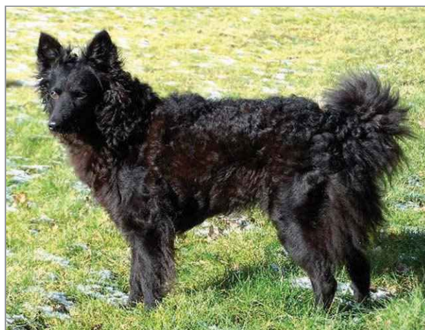
The coat is not corded like the Puli’s, but short or half-long, and curly.

He is not as boisterous as the Pumi, which serves him well as a companion dog in the house. Still, the Mudi is not a dog for beginners. He needs a firm hand and a lot of exercise, especially if there is no real work to do. In Sweden and Finland, Mudis are used as tracking dogs, rescue dogs, for agility and to drive sheep.