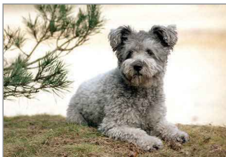
Most working sheepdogs in Hungary today are Pumis, but it's also an assertive companion dog that can be a living burglar alarm.