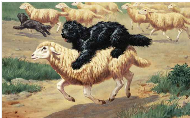
A Puli stops a runaway sheep by jumping on its back.