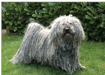
Male Puli with a gray coat