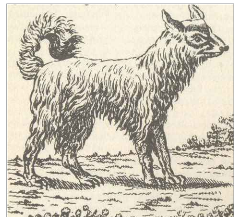
The first drawing of a Pumi dates from 1815

Dr. Emil Raitsits wrote the first breed standard (1921) and referred to the Pumi as a "sheepdog terrier." Pumis became fashionable in the show ring and excelled as working dogs. According to Raitsits, it was important to preserve the typical terrier qualities of the Pumi. Before 1923, Pumis were shown as local varieties of the Puli, but at the Budapest Dog Show in 1927, the