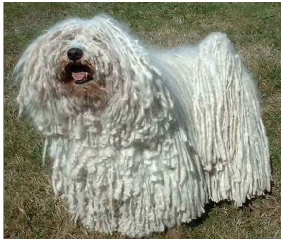
Solid black and reddish are the most popular Puli colors, but white, apricot and various shades of gray are also possible.

The early history of the Pumi is the same as that of the Puli and Mudi. In the 17th and 18th centuries, the first separation took