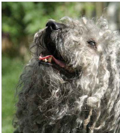
The Puli's eyes should be coffee-brown or black and free of discharge.