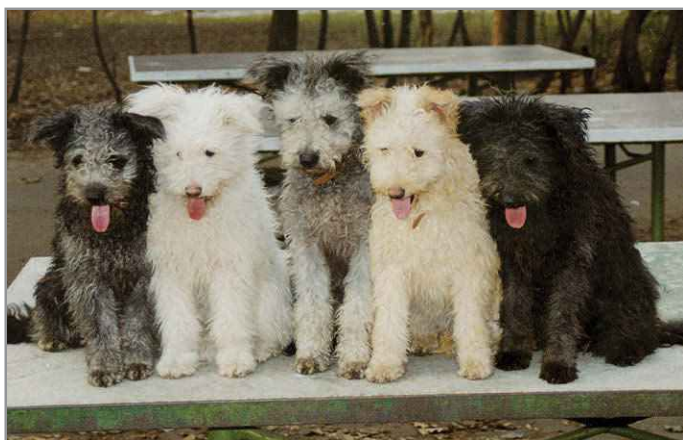
The Pumi comes in various solid colors. Multi colors and patches are eliminating faults.

The head is longer and more snikey than the Puli's, and has less stop. A strong, defined stop is an eliminating fault. The Pumi's coat is curly, but does not mat and is quite easy to groom. Pumis are sometimes born without a tail, or with a stumpy tail, but the standard requires a full tail. In countries where it was permitted, the tail was generally docked to two-thirds of its original length, but now a full tail is required. The smaller or larger ear tufts and typical ears make the clownish picture complete.