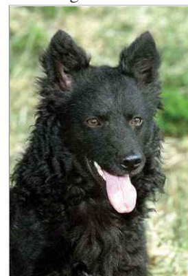
The Mudi’s eyes are oval, dark and obliquely set.

The Mudi Club of America – mudi.us/ – was founded in 2004 “to promote, protect and preserve the growing Mudi population. The American Kennel Club (AKC) has agreed to maintain Mudi records of registrations and pedigrees from domestic and foreign Mudi breeders in their Foundation Stock Service® (FSS) program.