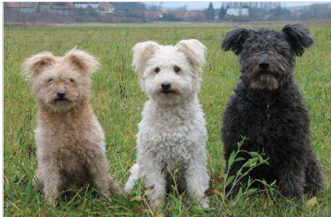
The Pumi is a rare breed - AKC Miscellaneous - in the United States.